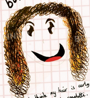
I think my hair is curly and crazy like spaghetti.