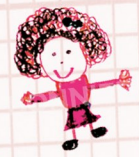
ESSIE-BEAU Age 5