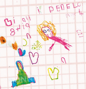
PENELope Age 4

When I have my hair cut it falls like in a box with fronds!