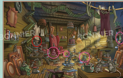
Behind the Walls