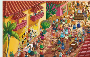
Madrigal Family Mural