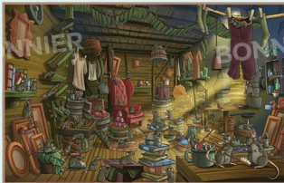
Behind the Walls