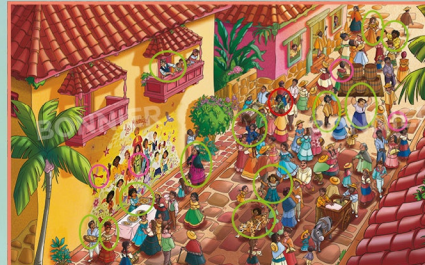
Madrigal Family Mural