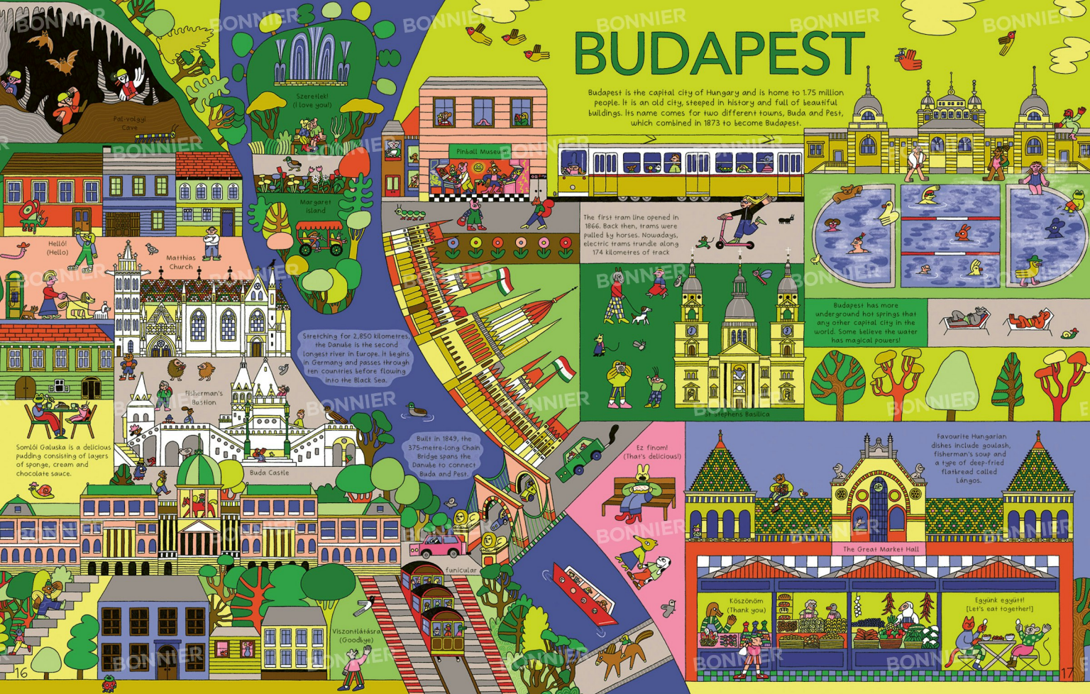
Szeretlek! (I love you!)

Budapest is the capital city of Hungary and is home to 1.75 million people. It is an old city, steeped in history and full of beautiful buildings. Its name comes from two different towns, Buda and Pest, which combined in 1873 to become Budapest.