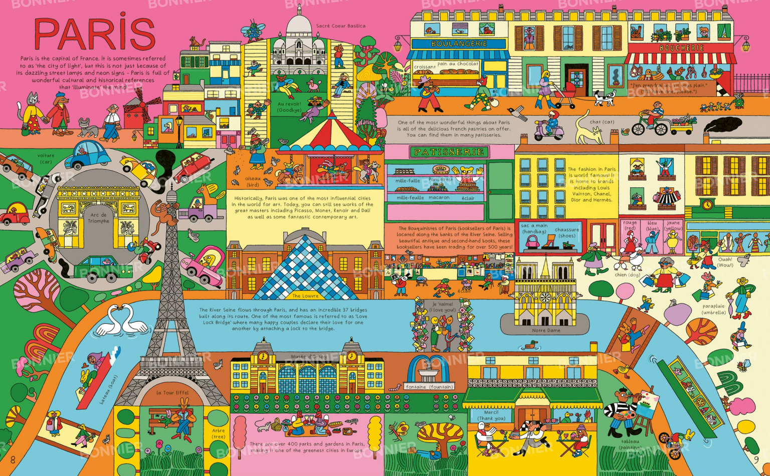
Sacré Coeur Basilica

Paris is the capital of France. It is sometimes referred to as 'the city of light', but this is not just because of its dazzling street lamps and neon signs - Paris is full of wonderful cultural and historical references that 'illuminate' the mind.