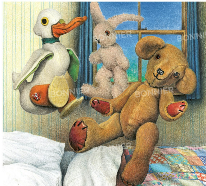
Here are three naughty toys jumping on the bed.