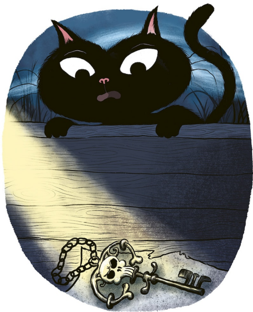
A creepy skeleton key on a rusty chain . . .