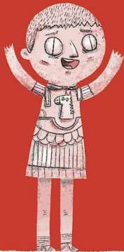
CALIGULA AD 37 – 41

Augustus was the first emperor of Rome. He wasn't very loveable, but he rebuilt Rome after all the fighting, established an army and brought peace back to the land. What a guy!