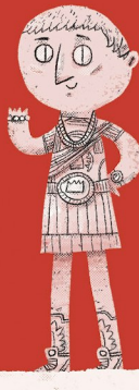
TRAJAN AD 98 – 117

Nero wanted to be a celebrity, but when he appeared on stage many people thought it was a bit silly. He didn't seem to care when a huge fire destroyed the city in AD 64, and the people turned on him.