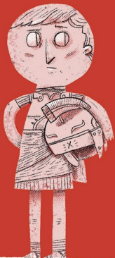
AUGUSTUS 27 BC – AD 14

You may be wondering why Julius Caesar isn't here amongst these other famous emperors. Well, that's because although Caesar was a powerful man, he was never actually an emperor. We'll find out more about him on pages 16 and 17.