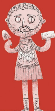
HADRIAN AD 76 – 138

Claudius was disabled and had trouble walking and speaking. At first he wasn't taken very seriously, but he turned out to be a great leader, expanding the empire and conquering Britain.