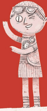
NERO AD 54 – 68

Hadrian was a clever general. He made the empire easier to defend and built a giant wall between England and Scotland to try and keep the people of the north out. Parts of the wall still stand today!