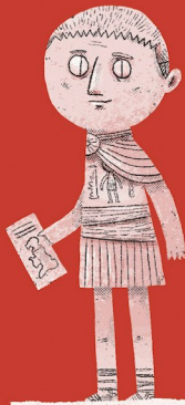
CLAUDIUS AD 41 – 54

Caligula was a violent leader who went mad with wealth and power. He once tried to put his horse in charge of the government! He was killed by his own bodyguards who decided to put a stop to him.