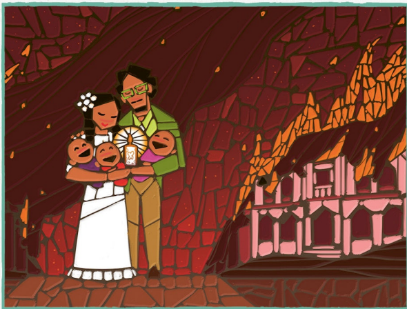
Abuela Alma’s magical candle is an important part of the story of Encanto, offering light in the darkness.

Mirabel gasped as beams of golden light reflected off her large, round spectacles and danced about the room.