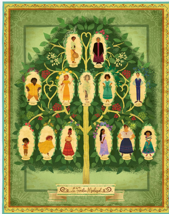
The extended Madrigal family, and the relationships between them, form the basis for the movie. LORELAY BOVE / DIGITAL

'What is your gift?' asked a little girl.