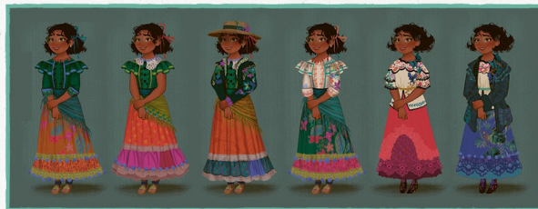
The costumes in Encanto were inspired by outfits found in the Andean region of Colombia, where the film is set.

But Mirabel did not like to talk about herself. Today wasn't about her, it was about Antonio and the family, so instead she told them all about the amazing Madrigals.