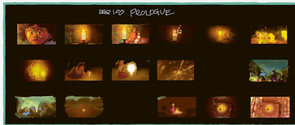
The animation sequence for the prologue is laid out, highlighting key moments in the story.

Mirabel snuggled in close as Abuela Alma began to tell the story of the candle and the magic it had brought into their lives. ‘This candle holds the miracle given to our family,’ she said, and the story began.