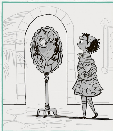
Mirabel is the only member of her family without a magical gift. This feeling of isolation was a key part of her character development.

'Make your family proud,' Mirabel said to herself as she left her room. To hasten her on her way, the tiled stairs of Casita transformed into a slide. Mirabel skidded down expertly, bidding good morning to a portrait of her grandfather Pedro as she passed.