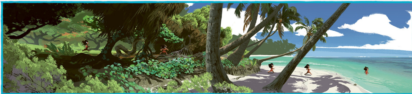
Motunui is a tropical island surrounded by a barrier reef. Moana's ancestors have called the island home for thousands of years.

Chief Tui led Moana to a sacred place at the top of a mountain. There, Moana saw a mysterious tower of flat stones, placed on top of one another.