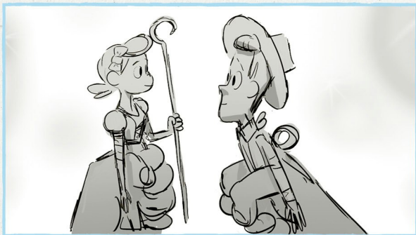
Sheriff Woody has always had a soft spot for porcelain shepherdess Bo Peep in the Toy Story films.

“Staff meeting, everybody,” Woody called. Woody directed Snake and Robot toy to build a podium for him, while he went in search of his doodle pad. Woody found it by Andy’s desk, but before he could grab it, Rex the dinosaur leapt out at him and roared. Woody barely looked up.