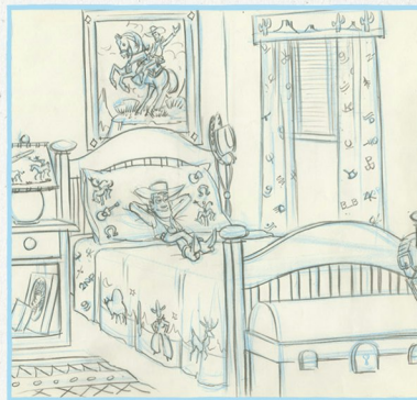
Many of Andy’s toys are based on vintage toys. Woody’s design took inspiration from the Howdy Doodie puppets of the 1950s. BUD LUCKEY / PENCIL

Rex asked why Andy’s party was today, when his birthday wasn’t until next week. Woody said it was probably because Andy’s mother didn’t want the party to get in the way of the big move.