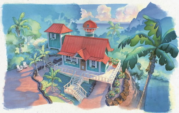
Lilo and Nani's house is inspired by buildings found in the laid-back towns of Kaua'i.

Lilo welcomed Stitch into his new home. She showed him a pillow. "Comfy!" Lilo said, but Stitch shredded it. Nani shouted at Stitch.