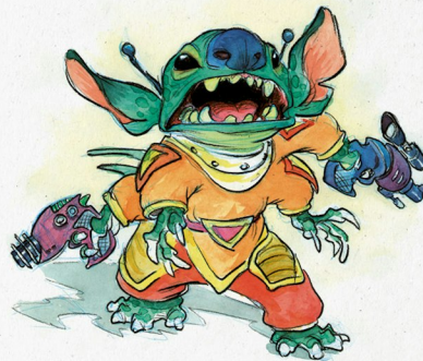
Stitch began as green, but was changed to blue in early development.

"We better call somebody," his passenger said.