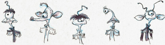
These character sketches of Pleakley show a variation of cyclops designs. ANDREAS DEJA / COLOURED PENCIL, INK AND MARKER

The Grand Councilwoman decided that to capture Experiment 626 quietly they would need someone who knew a lot about him. She asked Pleakley who he thought they should send. Pleakley suggested a family member might be able to help. But Experiment 626 did not have any family, and the person who knew him best, Jumba, was in prison.