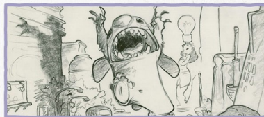
Earlier in the film, Stitch is seen looking at postcards of American landmarks, including a postcard of San Francisco. DISNEY STUDIO ARTIST / CONTE CRAYON

When he was done, Stitch tore through his city like a monster, toppling buildings and picking up cars and eating them.