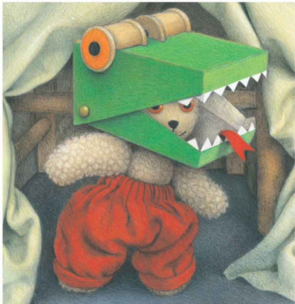
Little Bear's dragon mask has triangles for teeth.