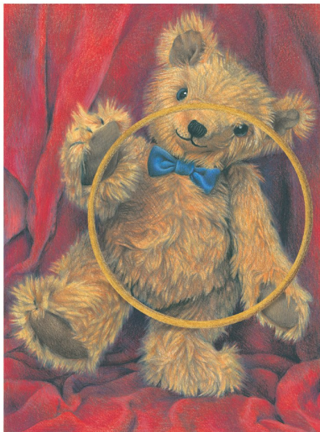
Bruno's wooden hoop is a circle .