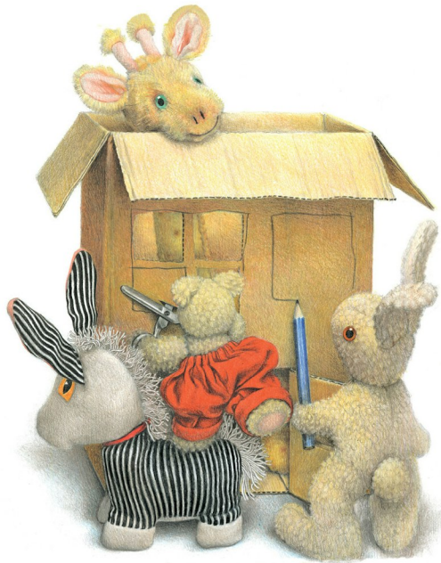
The toys are cutting out square windows.