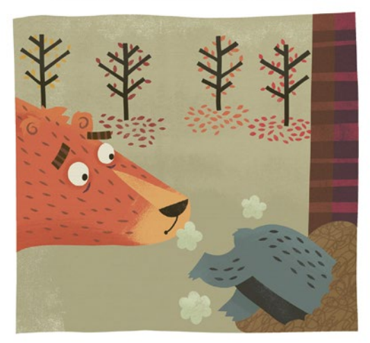
Perhaps a cosy underground burrow is what I need? thought Bear.

That day, Bear walked even further. He saw Badger burrowing into his sett for a snooze.