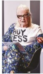
LEFT: Vivienne Westwood wearing one of her own designs in 'Buy Less, Choose Well' T-shirt