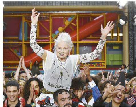
ABOVE: Vivienne Westwood takes her bow at the spring/summer 2018 London Fashion Week Men's collections, June 2017.

Westwood was the original multi-hyphenate and, in many ways, light years ahead of her time. She has inspired generations of designers that came after her, whether established and successful or aspiring and eager. Fashion critics even noted whiffs of her spirit at the London Fashion Week collections of autumn/winter 2023, which took place in February 2023, after her death. It's no wonder that her name is up there with the likes of Yves Saint Laurent, Christian Lacroix and the late great Karl Lagerfeld.