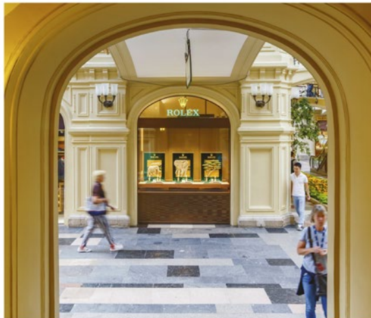
ABOVE: A Rolex boutique in the GUM State Department Store on Red Square in Moscow.

The story of Rolex is so much more than that of its watches. It is one of epic ambition and vision. What started out as a one-man band in London's Hatton Garden would become the epicentre of the Swiss watchmaking industry, and one of the most recognisable and coveted brands in the world.