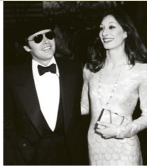
OPPOSITE: Fashion icon and author, Anna Wintour. ABOVE: Jack Nicholson and English Model of the Academy Awards, 1976.