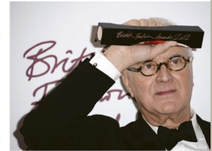
OPPOSITE: Manolo Blahnik at the British Fashion Awards 2012 at the Savoy Hotel.