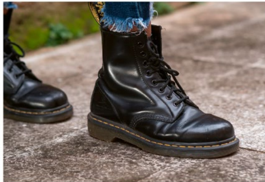
ABOVE: A classic pair of Dr. Martens 1460 boots, broken in with wear.

In contrast, the slicker-shaved subculture of Rockers who favoured leather motorcycle jackets, creepers, engineer boots and denim saw the Mod obsession with current fashion, jazz and R&B as effeminate, and numerous physical altercations between the two groups led to a moral panic about the ease of overly youth. Style-wise, the Mods eventually won out as their way of dress slowly seeped into the British mainstream, leading to the Swinging London phase of the 1960s. But as all trends go, as one fad falls out of favour, another one is right behind it to take its place.