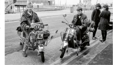
RIGHT: Two custom riding mod's take a break outside Hove Bay, East Sussex, circa 1963.

In contrast, the slicker-shaved subculture of Rockers who favoured leather motorcycle jackets, creepers, engineer boots and denim saw the Mod obsession with current fashion, jazz and R&B as effeminate, and numerous physical altercations between the two groups led to a moral panic about the ease of overly youth. Style-wise, the Mods eventually won out as their way of dress slowly seeped into the British mainstream, leading to the Swinging London phase of the 1960s. But as all trends go, as one fad falls out of favour, another one is right behind it to take its place.