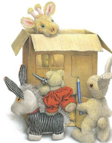
The toys are cutting out square windows.