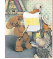
Bramwell is pointing to a yellow rectangle.