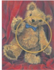
Bruno's wooden hoop is a circle.