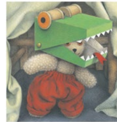
Little Bear's dragon mask has triangles for teeth.