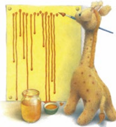
Jolly is painting with orange paint.