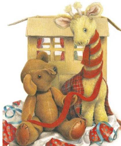
Bramwell has given Jolly a long red scarf.