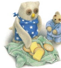
Hoot is sharing her yellow cheese.