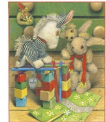
What is the green monkey eating?