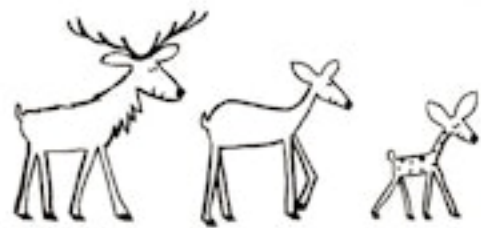
Male Female Baby

Deer live together in groups called HERDS.