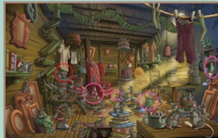
Behind the Walls