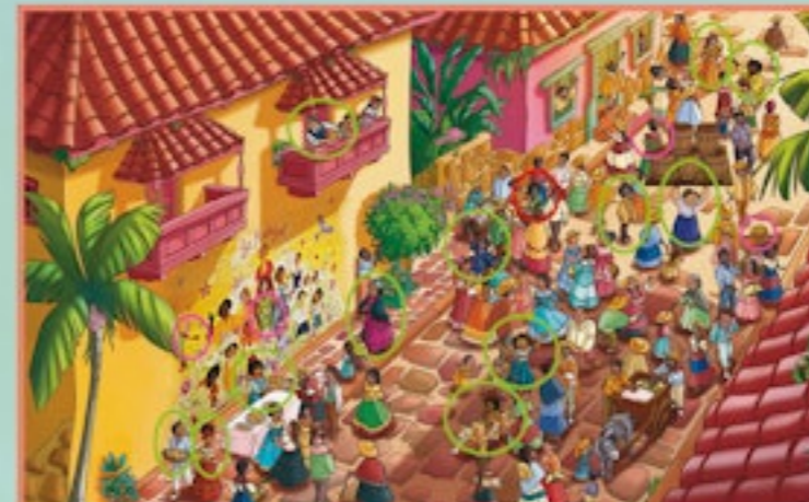
Madrigal Family Mural