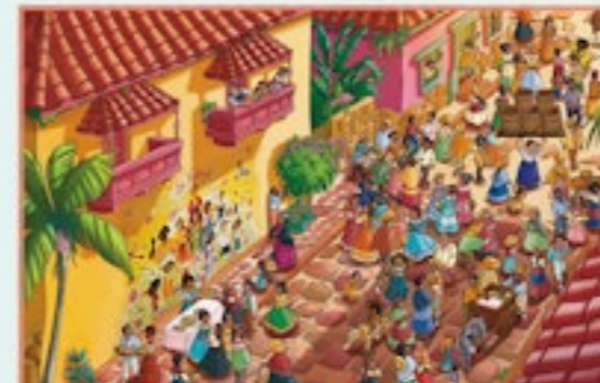
Madrigal Family Mural