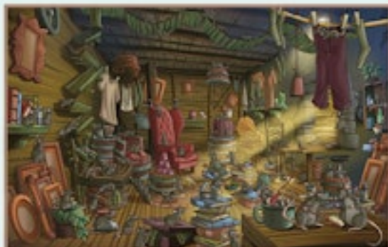
Behind the Walls