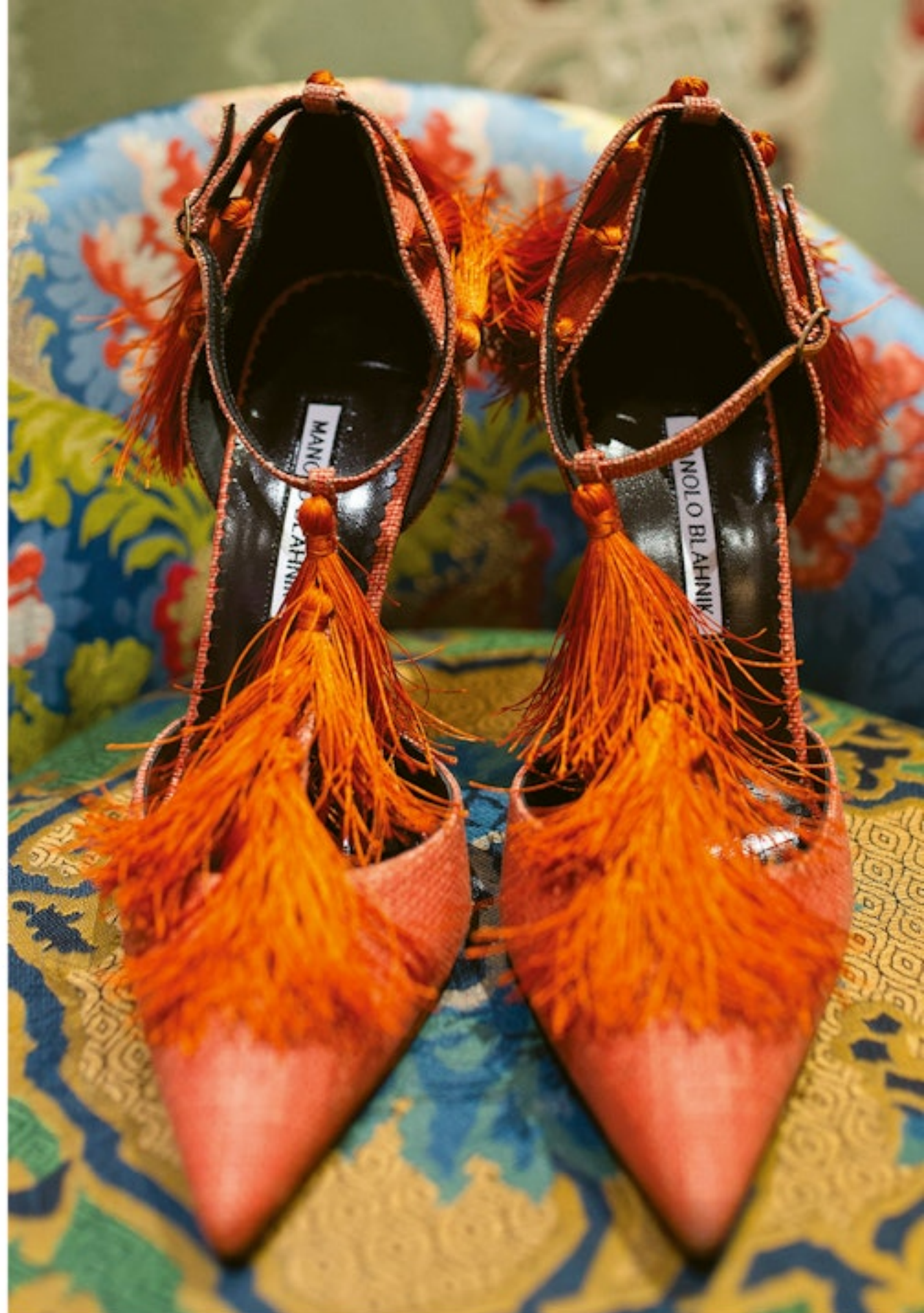
OPPOSITE: A tassel design for spring/summer 2014 at London Fashion Week.