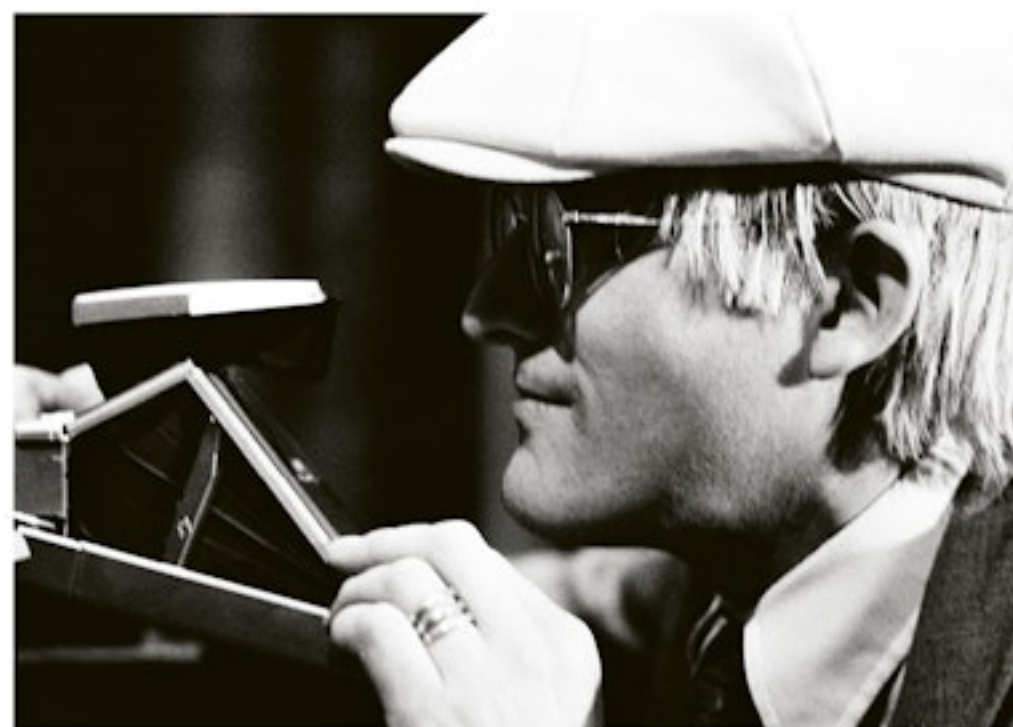
ABOVE: The artist David Hockney, circa 1978, wore the early designs of Manolo Blahnik.

By the early 1970s, he had taken that all-important trip to New York with Paloma; by the time he returned, the wheels were already in motion and soon after, Blahnik became a design consultant at Zapata. He designed his first pair of shoes for men. Friends, including the painter David Hockney, wore them but they were not successful commercially. No matter – Blahnik's big break was just around the corner.