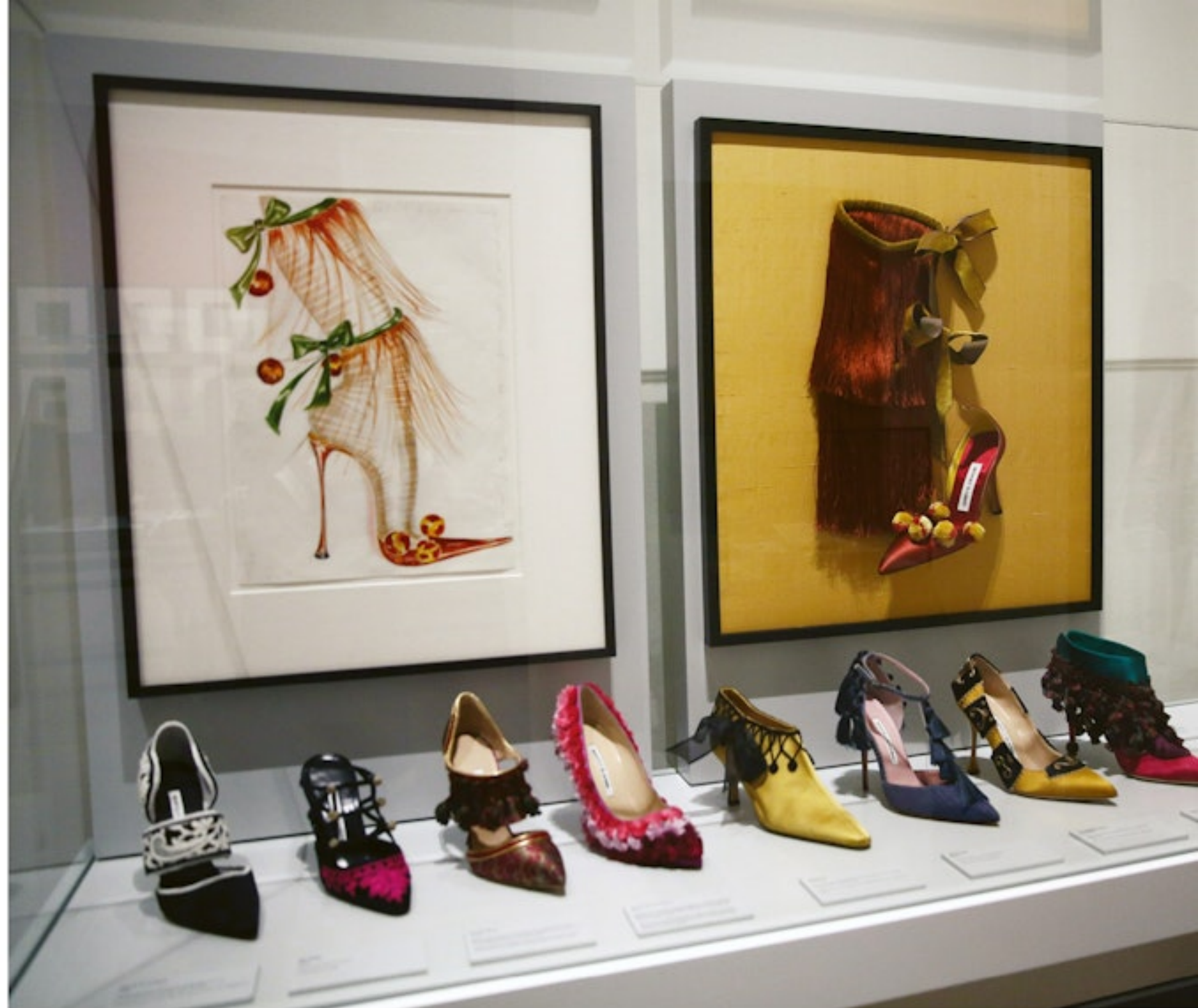
ABOVE: Inside Manolo Blahnik's The Art of Shoes exhibition, 2017.

The Craft was added to this in 2023 – a new space which celebrates the craftsmanship of each shoe and shares insights behind the making, such as sketches, fine details and the journey of the shoe from concept to finished product.