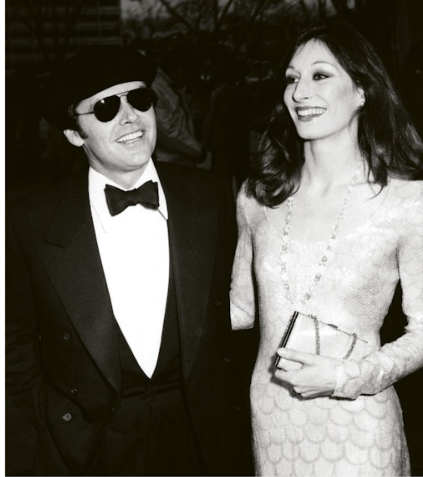
OPPOSITE: Fashion icon and writer, Anna Piaggi.