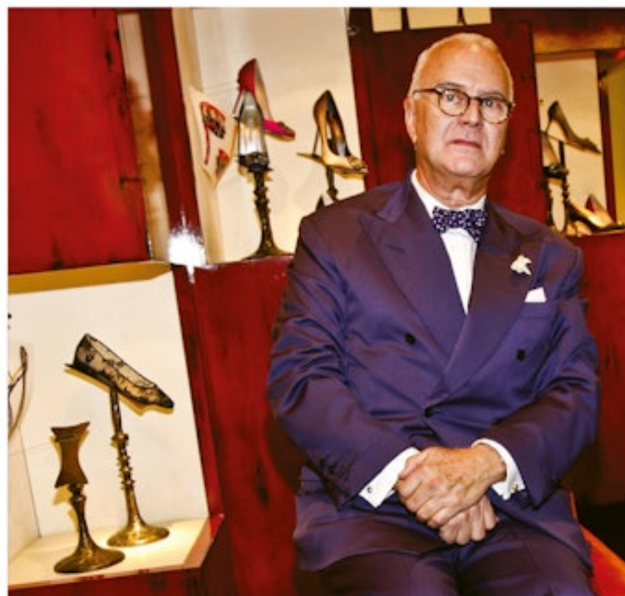
LEFT: Manolo Blahnik at Bergdorf Goodman, October 2010, New York City, for Manolo's New Shoes book signing.