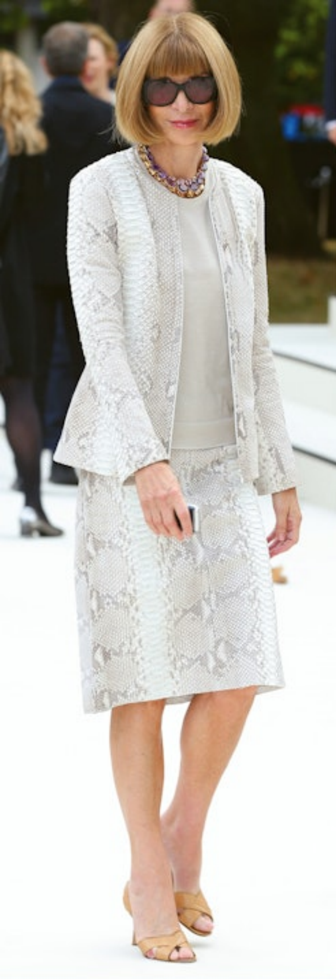
LEFT: Anna Wintour at the Burberry show, 2012.