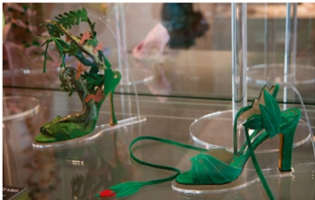
ABOVE: Botanical inspired designs.

Despite a great many wonderful confections, Blahnik has said that, today, the best shoes are the simple ones. He himself is often spotted in an elegant slipper.