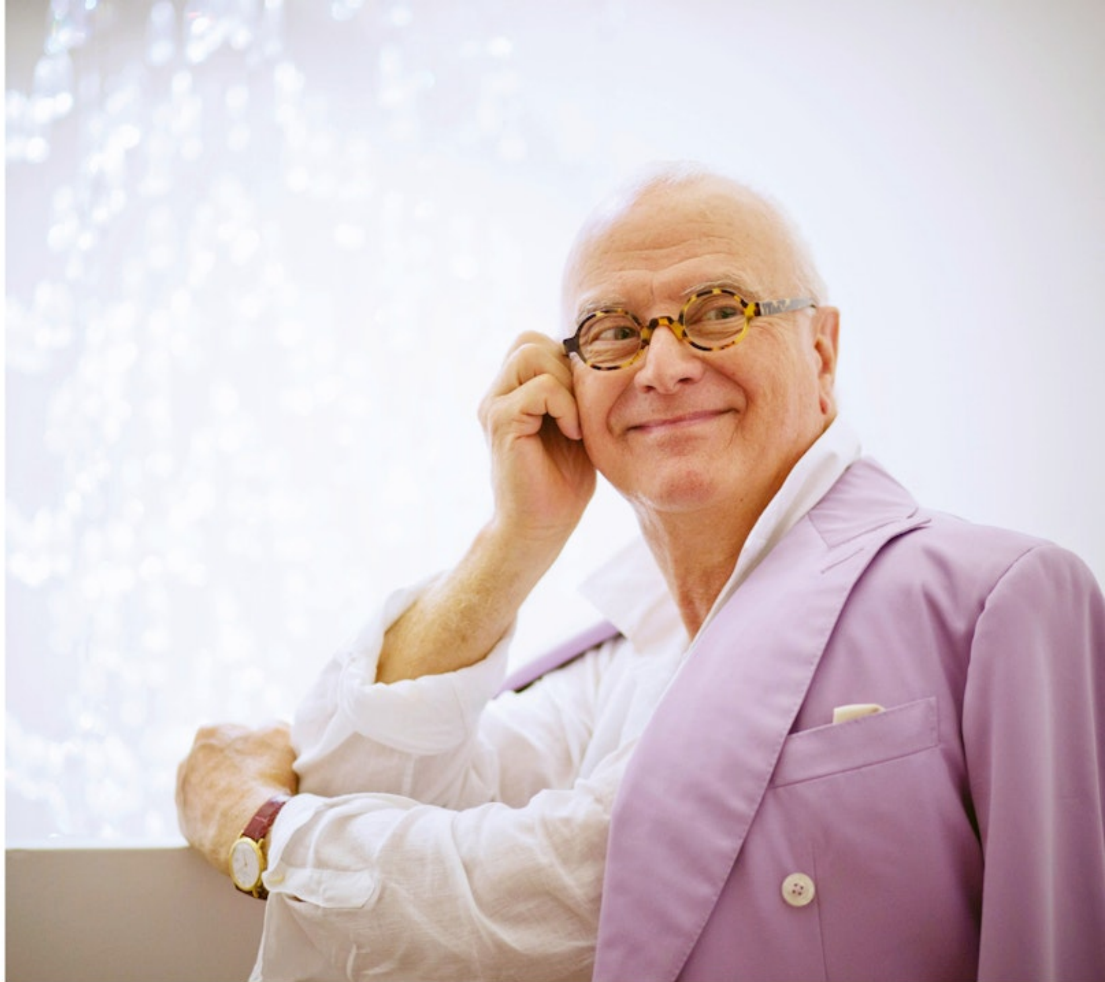
RIGHT: The man behind jewellery for the feet, Manolo Blahnik.