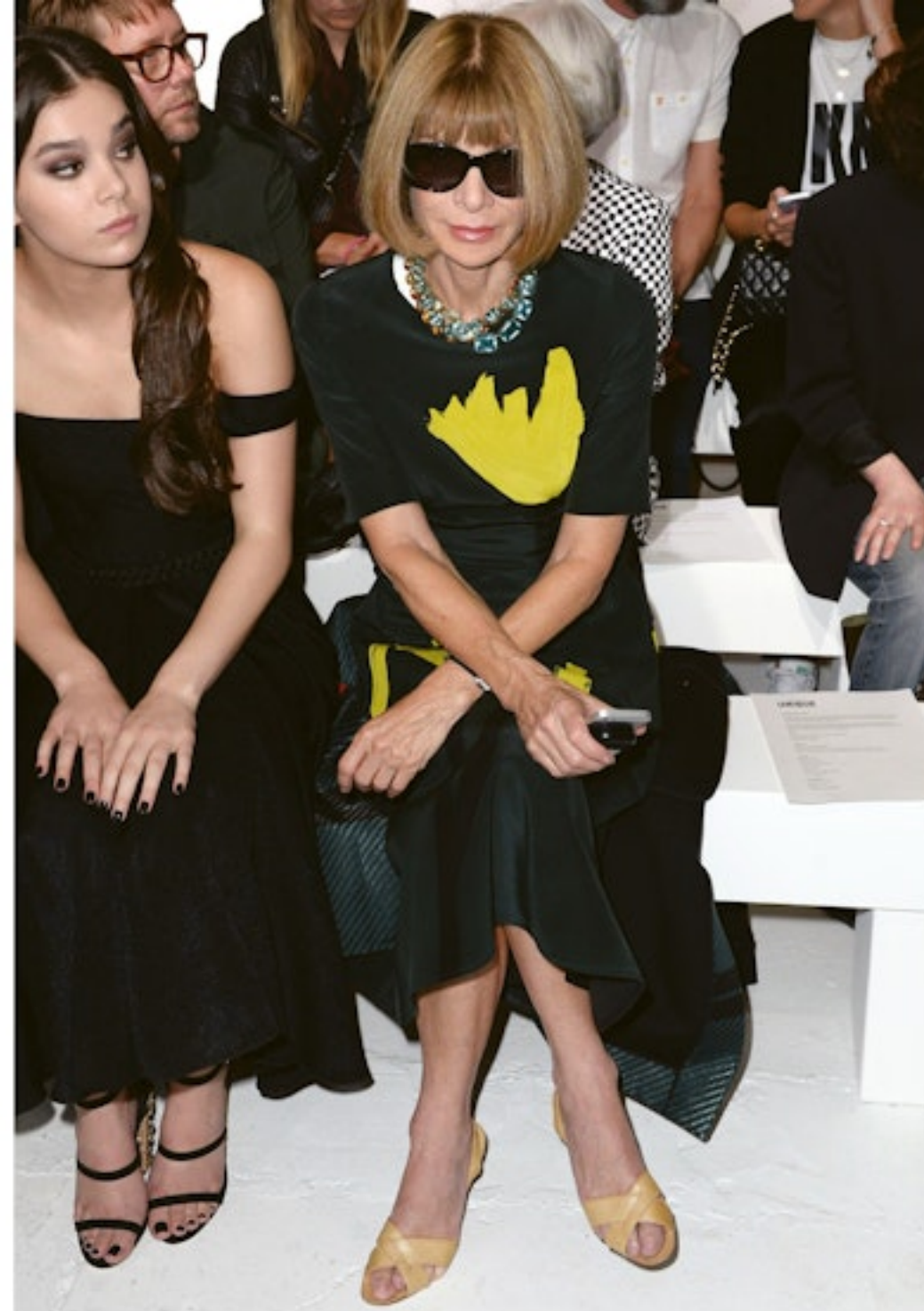
OPPOSITE: Anna Wintour at London Fashion Week, spring/summer 2013.