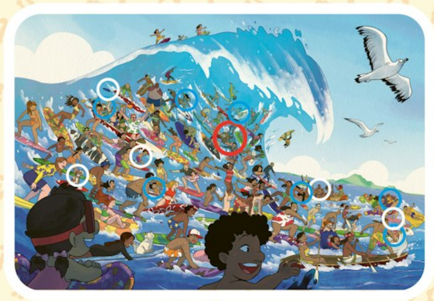
The Great Wave