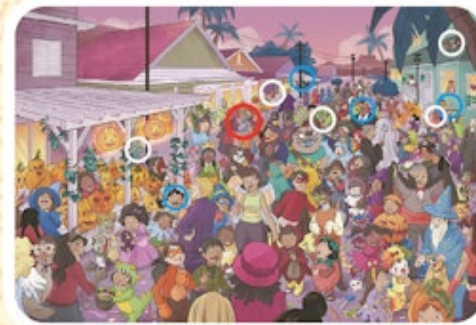
Halloween Street Party

How did you do? Whether you found them all or not, your 'ohana is proud of you!