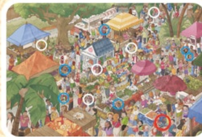
The Outdoor Market